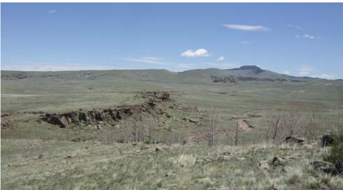
Overview of jump cliff at 5FN494